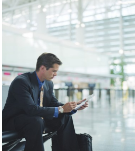
Who sponsors such a great group?

CITPG stands for Carolina IT Professionals Group . We have members at all levels of knowledge. Carolina IT is made up of people who have been in some computer field for all their career, those who work in a computer field now and those who are just starting. We're proud to say that Carolina IT is the largest group of its type in the USA.